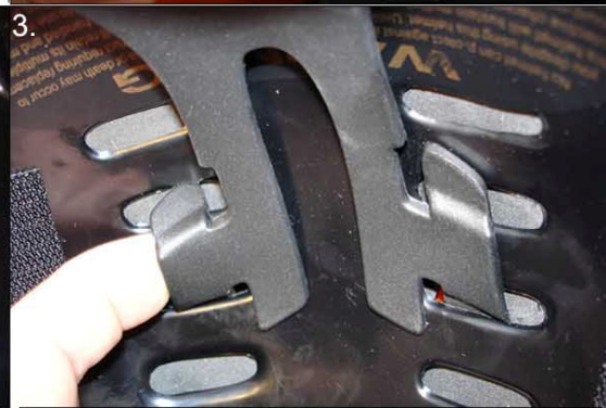
3. Bend tab and insert into slot with forefinger.