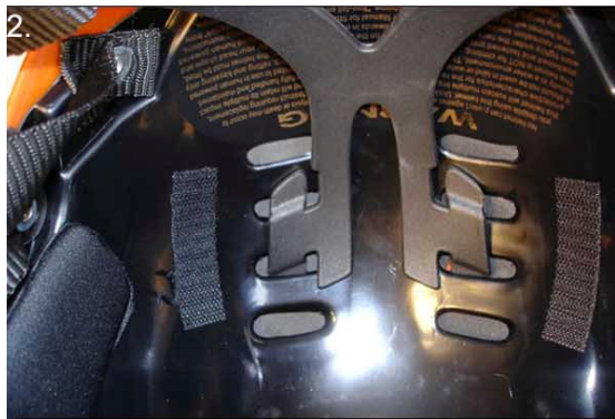
2. Insert front tabs into desired position.