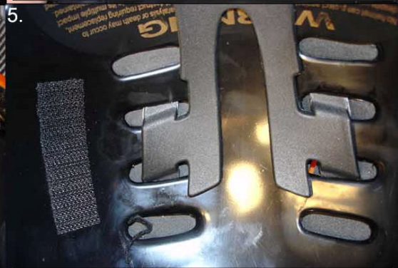
5. Correct installation of O-Brace.