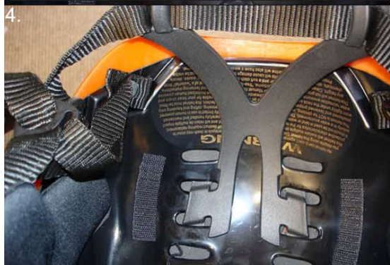
4. Repeat process on other side - bend tab and insert with forefinger.